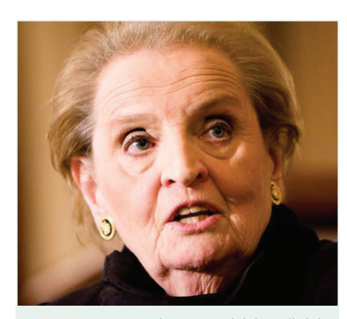
Former Secretary of State Madeleine Albright

Dr. Albright said, "As someone who has the deepest respect and admiration for the men and women of the United States military, I am honored to join Protect Our Defenders' advisory board. I strongly support their efforts to give voice to service members who have been sexually assaulted or harassed and to ensure that our military justice system is impartial and effective. These crimes go against the core values of the armed forces. Eradicating sexual assault and harassment from our military will make it stronger and better, and I am proud to stand behind this cause."